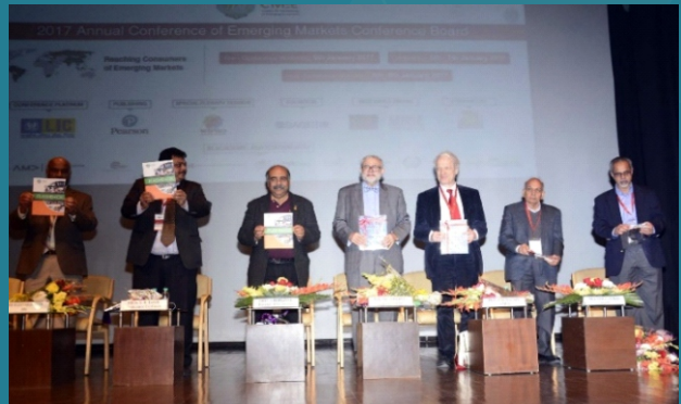
Launch of CME Flashback at 2017 EMCB conference by Late Prof. Ajit Prasad, Director-IIML at 2017 EMCB Conference