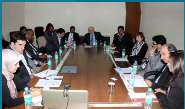
Formation of Emerging Marks Conference Board (EMCB) at 2012 EMCB Conference