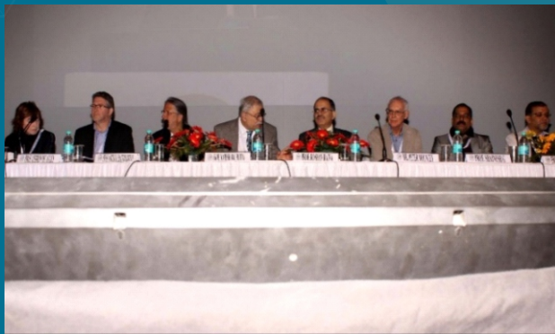
Editors Meet at 2014 EMCB Conference